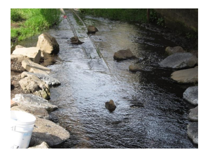
Stream running from main spring