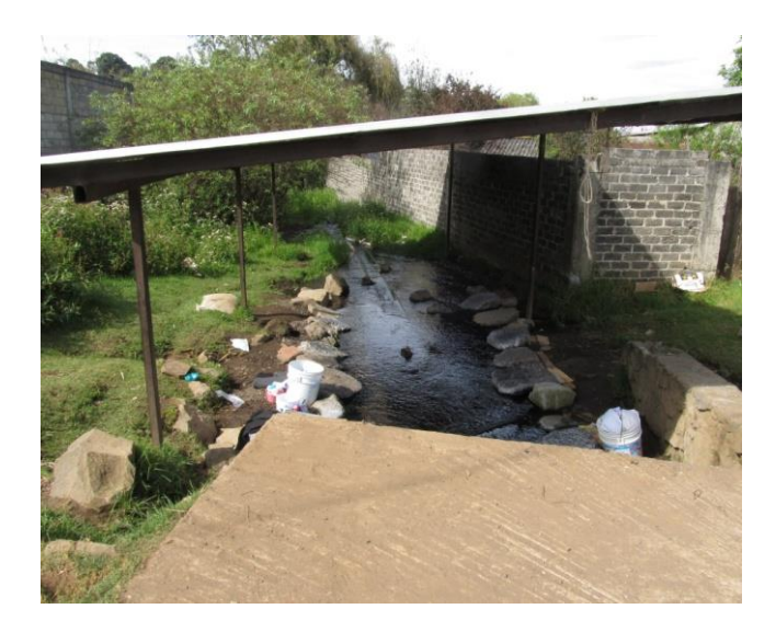
Area for Locals to do their washing

meeki . It is a small spring that drains into a deep mountain lake, Lago de Zirahuén. A.meeki used to live in the lake itself but is now considered extinct here, only living in some of the tributaries draining into it