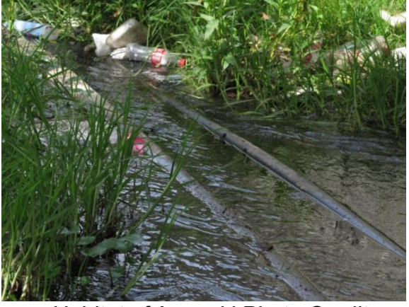
Habitat of A.meeki