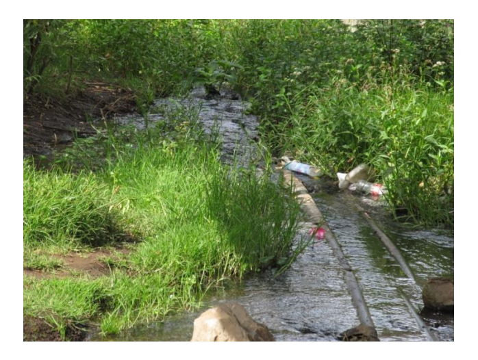
Habitat of A.meeki